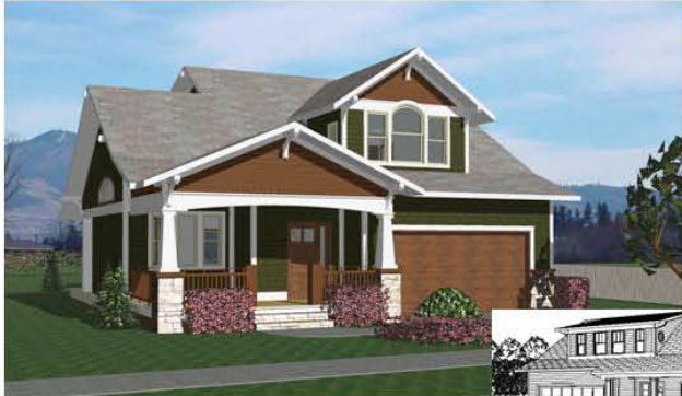
Front Façade Option #2